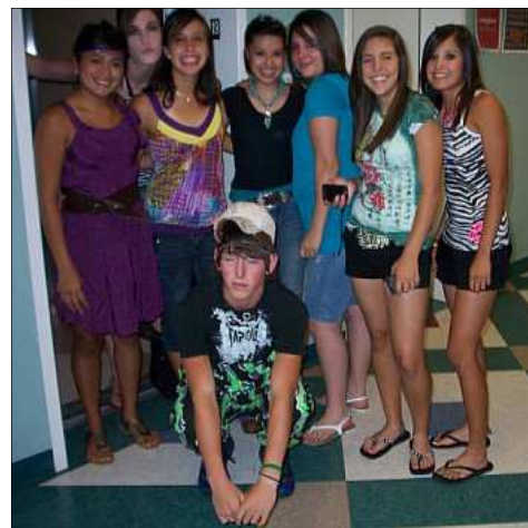
Getting ready for the dance!