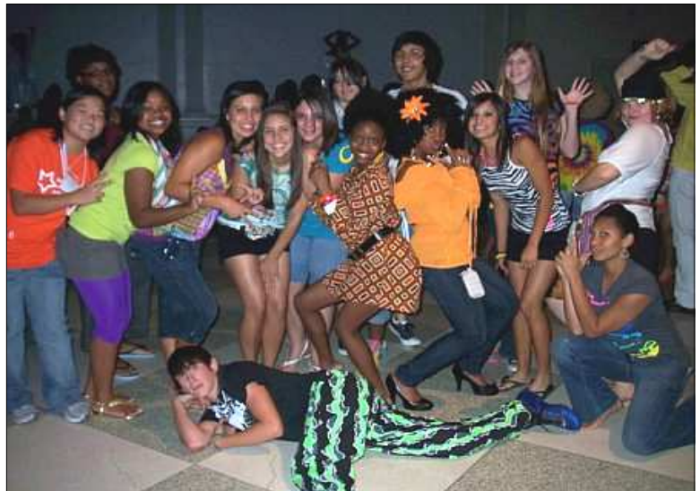
The Gang at the Dance!!!!