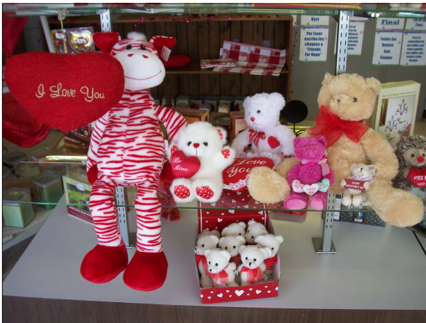
Valentine's items at The Hope Chest